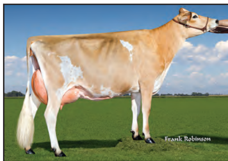
Sold in the 2012 Pot O'Gold Sale JX Grazeland Plus Krystaleen{4}, E-90% 3-0 305 23,550 4.9% 1,161 3.8% 889