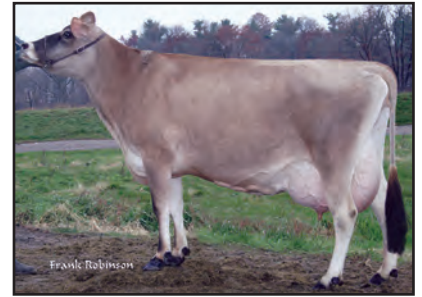
DUTCH HOLLOW KLASSIC DEVA-P-ET Great-Grandam of Lot 112

DUTCH HOLLOW VINTAGE-P-ET USA 067184498 GT50K BBR 100 JH1F 200JE499 CDCB GPTA S 08/01/2020 223DAUS 55HRDS 4%RIP 96%R -527M 0.05% -15F 24%ILE 97%R 0.04% -12P 93CM$ 85NM$ 68FM$ 121GM$ 2.9PL 2.5LIV 2.3DPR 2.5CCR 0.6HCR 2.905CS 0.1MFV 0.5DAB 0.2KET 0.6MAS 0.7MET 0.2RPL 4.94HTI AJCA 08/01/2020 115DAUS GPTAT 94%R 1.2 GJUI 8.3 GJPI 92%R 24