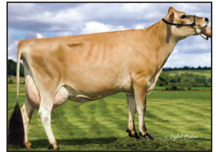
DUTCH HOLLOW NATHAN DEE-ET Sister to the Grandam of Lot 112

WINNER FOR FAT & PROTEIN, 2020 LEADING LIVING LIFETIME CONTEST LIFETIME TOTAL OF 282,449M, 15,838F, 10,626P IN 4,414 DAYS SIRE: O.F. MANNIX REBEL-ET GJPI -17 11%ILE