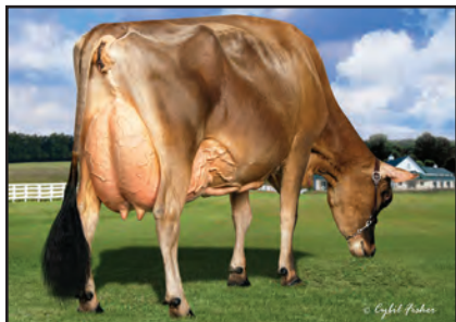
FERMAR PARAMOUNT JOY Grandam of Lot 117

4TH DAM: EARLY RISE MALCOLM JONI VG 85 (CAN) 7-08 305 2 17695 4.1 728 3.6 633 CAN 2043C