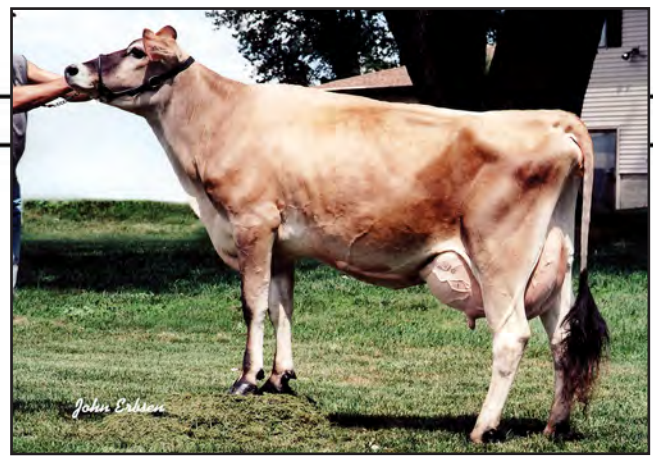
JX BOHNERTS CHARNESA VIENA {4} (TWIN), VG-85% Fourth Dam of Lot 107