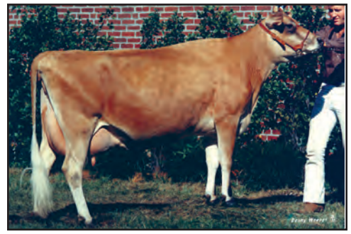
Sold in the 1967 Pot O'Gold Sale Ettas Master Babe, E-94% 11-4 365 17,550 5.3% 922 Winner, 1970 Pot O'Gold Production Contest 1970 National Jersey Jug Futurity Winner