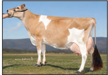
DUTCH HOLLOW SCHOLAR CHARM Fourth Dam of Lot 119