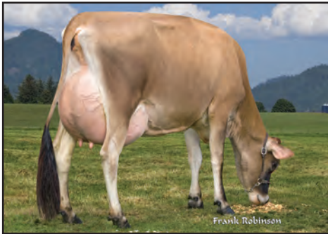
Sold in the 2008 Pot O'Gold Sale Boyd-Lee Matinee Holly-ET, VG-86% 1-11 305 19,120 4.7% 904 3.4% 655