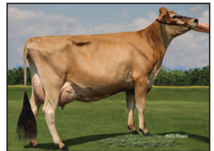
JX DUTCH HOLLOW GOLDA DEVON {4} Sister to the Grandam of Lot 112

SISTER(S): DUTCH HOLLOW NATHAN DEE-ET 84% 5-09 305 3 28510 5.5 1566 3.3 953 102DCR 3292C DUTCH HOLLOW BLAIR DATE {6}-ET 82% 6-00 305 3 25910 4.9 1271 3.2 835 102DCR 2882C DUTCH HOLLOW BLAIR DABE {6}-ET 80% 2-09 305 3 20100 5.7 1152 3.9 787 102DCR 2724C DUTCH HOLLOW BLAIR DAZE {6}-ET 90% 3-02 305 2 21710 4.0 858 3.2 695 94DCR 2332C DUTCH HOLLOW BLAIR DALE {6}-ET 91% 5-11 301 3 24580 5.2 1288 3.3 821 102DCR 2835C DUTCH HOLLOW IATOLA DHARMA 81% 2-09 305 3 20370 5.0 1014 3.7 762 101DCR 2636C JX DUTCH HOLLOW GOLDA DEVON {4} 84% 5-00 305 3 27880 5.2 1451 3.4 955 102DCR 3300C