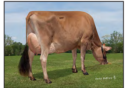
PINE-TREE LEXICON FROSTY-ET Sister to the Dam of Lot 102