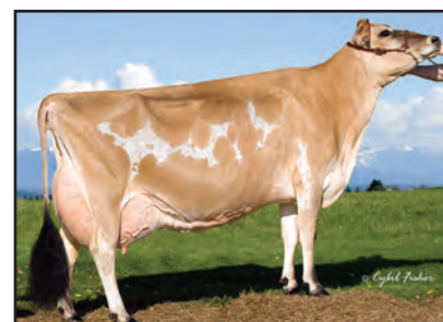
PLEASANT NOOK F PRIZE CIRCUS, E-97% Seventh Dam of Lot 118