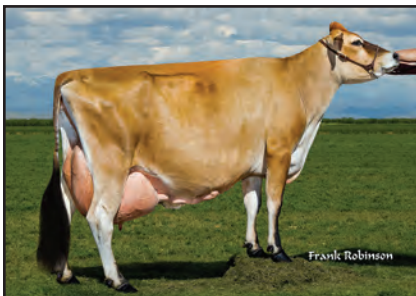
AHLEM TBONE MAGGIE 31936 Grandam of Lot 103

SISTER(S): JX AHLEM EUSEBIO MAGGIE 51184 {5} 84% 1-11 305 2 14170 5.1 721 4.2 598 95DCR 1987C AHLEM URLACHER MAGGIE 57722-ET RANKS ON THE TOP GJPI HEIFER LIST