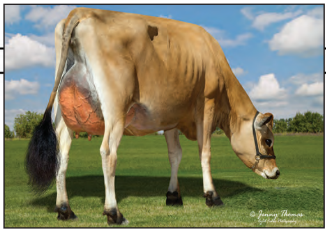
AVI-LANCHE VICEROY JACKPOT 16137 Dam of Lot 111