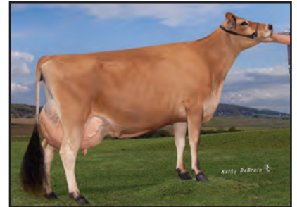
HI-LAND ZIPPER FLUFFY Grandam of Lot 102

6TH DAM: HI-LAND BERRETTA FRAZIER 88% 6-05 305 2 22550 4.5 1013 3.5 787 93DCR 2710C