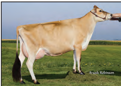
AHLEM LEGAL MAGGIE 35894 Sister to the Dam of Lot 103

BROTHER(S): AHLEM PLUS MOHICAN {6}-ET AT GENEX / CRI GJPI 39 45%ILE AHLEM VISIONARY MIWUK 22065 AT SELECT SIRES GJPI 21 36%ILE