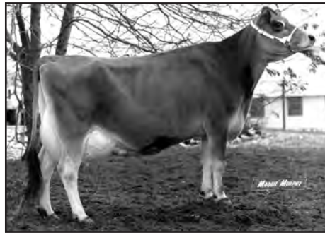
Sold in the 1971 Pot O'Gold Sale Generators Faustine of Ogston, E-93% 4-3 365 24,440 4.3% 1,059 Dam of A-Nine Top Brass Winner, 1974 Pot O'Gold Production Contest