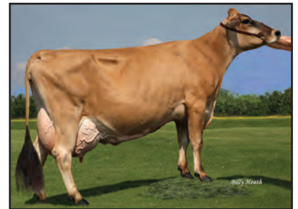
DUTCH HOLLOW REBEL DIVA-P Grandam of Lot 112

JX SUNSET CANYON GOT MAID {5}-ET USA 119407594 GT99K BBR 100 JH1F 551JE1650 CDCB GPTA S 08/01/2020 1723DAUS 76HRDS 74%RIP 99%R 1615M -0.01% 75F 99%ILE 99%R 0.02% 63P 580CM$ 550NM$ 488FM$ 407GM$ 4.1PL -2.8LIV -3.0DPR -2.5CCR -0.9HCR 2.675CS 0.0MFV -0.1DAB 0.2KET -2.1MAS 0.1MET 0.1RPL -3.77HTI AJCA 08/01/2020 889DAUS GPTAT 99%R 0.6 GJUI -3.2 GJPI 93%R 140