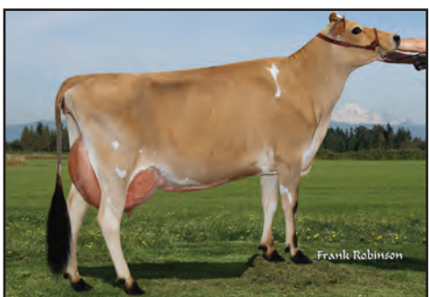
Sold in the 2009 Pot O'Gold Sale Kilgus Finalist Gem, VG-87% 1-11 365 36,400 5.0% 1,816 3.4% 1,226 Winner, 2011 Pot O'Gold Production Contest