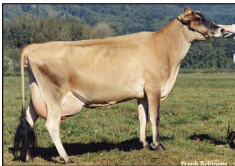
Sold in the 1997 Pot O'Gold Sale Rebob Barber Hurrah, E-90% 1-11 305 19,070 5.4% 1,021 372% 702 Winner, 2000 Pot O' Gold Production Contest