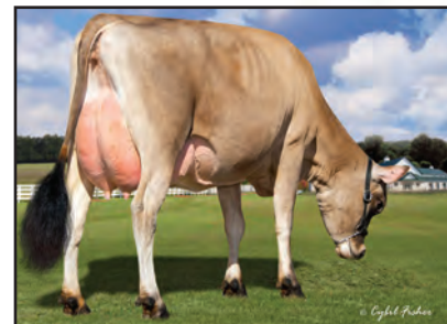
GOFF PHAROAH CIRCUS ACT-ET Great-Grandam of Lot 118

USA 117046049 GT50K BBR 100 JH1C TATTOO J05/J05 DHIA HERD # 33-87-0722 CONTROL # 813 2-02 305 3 18470 4.7 865 3.4 633 100DCR 2187C 4-03 271 3 22660 4.4 999 3.6 823 102DCR 2740C 305 2X ME AVG 2L 19070M 900F 699P 2370C PPA 1421M 85F 50P / YD 347M 58F 15P CDCB GPTA S 10/06/2020 2RECS 89%R 69%ILE -11M 0.13% 28F 0.01% 1P 114CM$ 111NM$ 104FM$ 0.5PL -3.2LIV 0.1DPR -0.3CCR 0.6HCR 2.94SCS 110GM$ 0.0MFV 0.0DAB 0.0KET 0.2MAS -0.2MET 0.3RPL 0.47HTI AJCA 10/06/2020 GPTAT 87%R 0.7 GJUI 0.8 GJPI 85%R 29