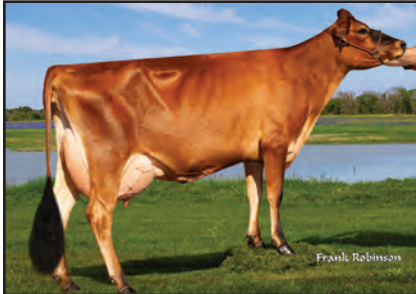
AHLEM TEXAS MAGGIE 47203-ET Dam of Lot 103

AHLEM FARMS PARTNERSHIP BREEDER & OWNER HILMAR, CA 209-632-5822