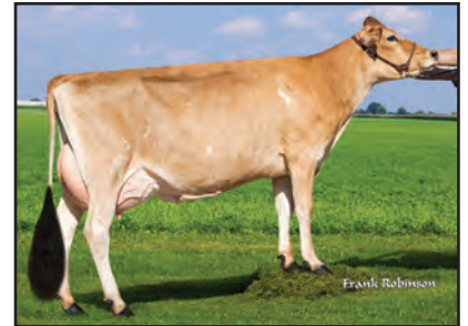
JX DUPAT CHARLES 14227 {5} Dam of Lot 120

JX SUNSET CANYON GOT MAID {5}-ET USA 119407594 GT99K BBR 100 JH1F 551JE1650 CDCB GPTA S 08/01/2020 1723DAUS 76HRDS 74%RIP 99%R 1615M -0.01% 75F 99%ILE 99%R 0.02% 63P 580CM$ 550NM$ 488FM$ 407GM$ 4.1PL -2.8LIV -3.0DPR -2.5CCR -0.9HCR 2.67SCS 0.0MFV -0.1DAB 0.2KET -2.1MAS 0.1MET 0.1RPL -3.77HTI AJCA 08/01/2020 889DAUS GPTAT 99%R 0.6 GJUI -3.2 GJPI 93%R 140