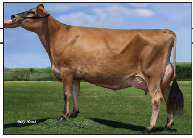
DUTCH HOLLOW VALENTINO CHEER, E-90% Great-Grandam of Lot 119