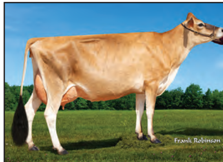
Sold in the 2016 Pot O'Gold Sale Gram-Way Chili Daphne-ET, VG-87% 2-10 305 16,010 5.2% 825 3.8% 612