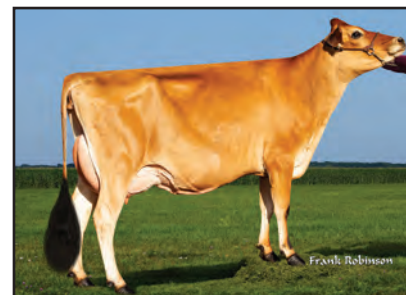
PRIMUS DISCO CAROLINE 100407-ET Dam of Lot 118

NEXT FIVE DAMS ARE VERY GOOD OR EXCELLENT