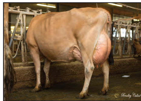
Sold in the 2013 Pot O'Gold Sale JX Shan-Mar Fastrack Cherita {4}, VG-86% 5-11 305 3x 25,110 4.8% 1,212 3.5% 886