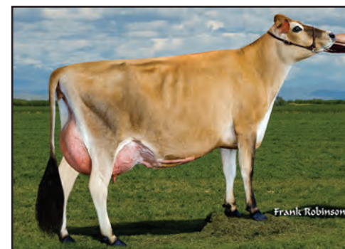
Sold in the 2012 Pot O'Gold sale Peelers Louie Presca, VG-87% 2-11 305 27,900 4.6% 1,274 3.4% 961 Winner, 2015 Pot O'Gold Production Contest