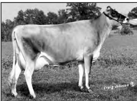
Sold in the 1986 Pot O'Gold Sale Greenwood Chief Glad Tidings, VG-85% 4-6 305 22,590 4.9% 1,097 3.6% 806 Winner, 1989 Pot O'Gold Production Contest