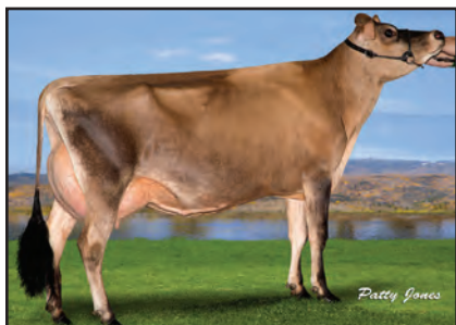
GUIMO SPECTACULAR JOELLE Sister to the Dam of Lot 117