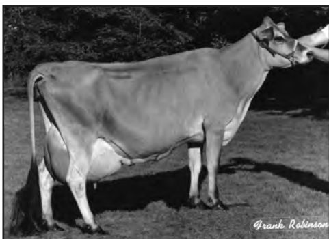
Sold in the 1987 Pot O'Gold Sale Duncan Brave PR Dee, VG-84% 7-3 305 24,920 4.7% 1,165 3.7% 911 Winner, 1990 Pot O'Gold Production Contest