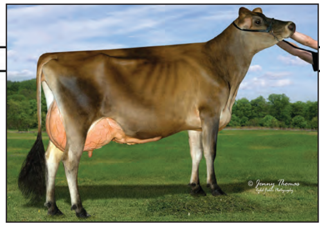
OSU-ATI TEXAS BUFFY 2521, E-94% Dam of Lot 101