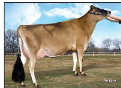
GOFF VALENTINO 9595 Fourth Dam of Lot 118