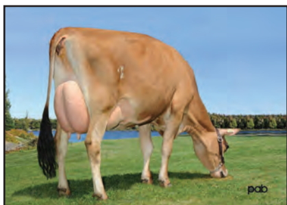
GUIMO ARROW JACEY-ET Sister to the Dam of Lot 117