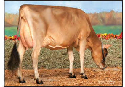
PTJ PLUS WANDA {6}-ET Sister to the Dam of Lot 106