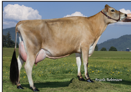
SUN VALLEY JUPITER DOLLAR, VG-83% Dam of Sun Valley Champ Dollar (14JE 592) From the Same Family as Lot 115

SUNSET CANYON DOMINICAN-ET USA 117013483 GT50K BBR 100 JH1F 1J1E770 CDCB GPTA S 08/01/2020 5675DAUS 530HRDS 3%RIP 99%R 113M 0.04% 14F 28%ILE 99%R 0.00% 5P 97CM$ 91NM$ 81FM$ 106GM$ 2.0PL 0.2LIV 1.9DPR 1.0CCR 3.1HCR 2.84SCS -0.1MFV 0.2DAB -0.6KET 0.2MAS 0.8MET -0.1RPL -0.28HTI AJCA 08/01/2020 1574DAUS GPTAT 99%R -1.1 GJUI -11.3 GJPI 99%R 36