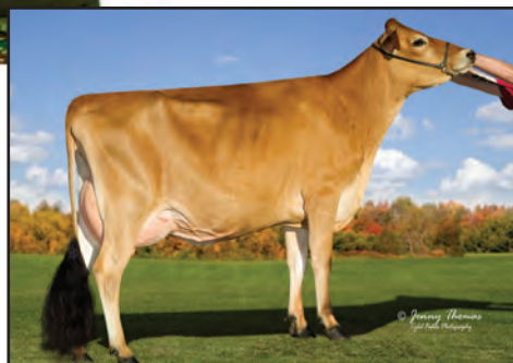
Sold in the 2017 Pot O'Gold Sale Sun Valley Jive Tart, VG-86% 1-9 305 3x 19,890 5.5% 1,100 3.7% 726