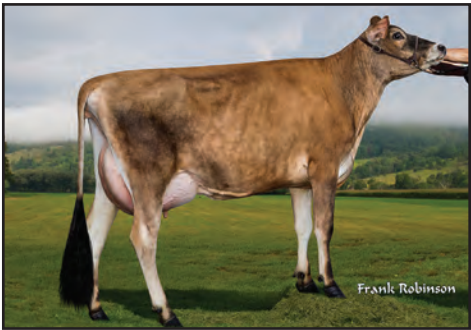
Sold in the 2013 Pot O'Gold Sale Lost Hill Dimension Holly, VG-84% 1-10 291 19,680 6.7% 1,325 3.7% 737 Winner, 2016 Pot O'Gold Production Contest