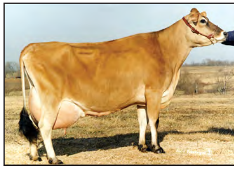
Sold in the 1994 Pot O'Gold Sale LJF2 SB Berretta Haley, E-90% 4-2 365 32,420 5.2% 1,678 4.3% 1,386 Former #1 PTI Cow Winner, 1997 Pot O'Gold Production Contest