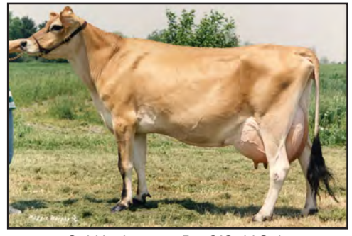
Sold in the 1991 Pot O'Gold Sale Mar Kut Sooner 920, E-91% 3-0 305 24,190 4.7% 1,131 3.2% 774 Winner, 1996 Milking Competition Brazil National Winner, 1994 Pot O'Gold Production Contest