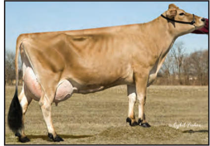
DUTCH HOLLOW JACKSON CHARITY Fifth Dam of Lot 119