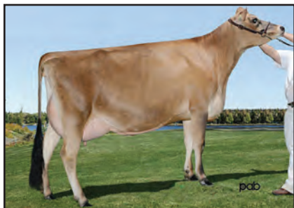
GUIMO DYNAMIC JOYCE-ET Sister to the Dam of Lot 117