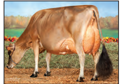
AHLEM ACTION WINSOME 33421 Grandam of Lot 106

4TH DAM: AHLEM HALLMARK WINSOME 2020 82% 6-01 302 3 27780 5.1 1427 3.7 1024 99DCR 3542C