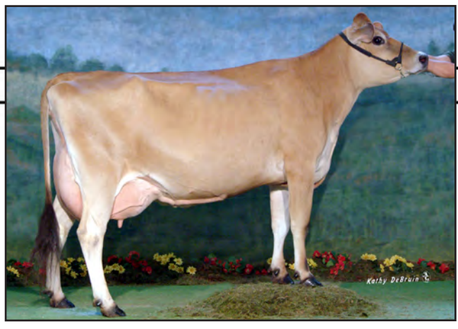
COUNCILLER MAE OF FREEMAN, E-92% Fifth Dam of Lot 113