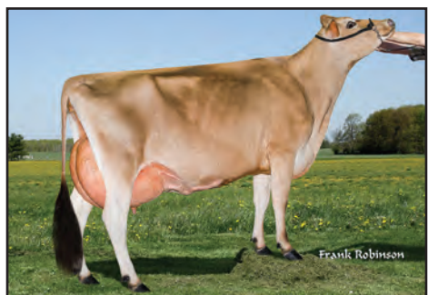
Sold in the 2011 Pot O'Gold Sale Heinz Lotto Linette 7132 {4}, VG-88% 4-10 305 3x 21,770 4.8% 1,039 3.7% 797