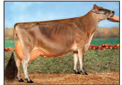
AHLEM ACTION WINSOME 33421 Grandam of Lot 106