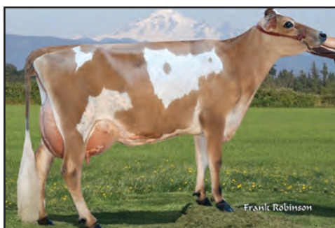
Sold in the 2007 Pot O'Gold Sale Havs latola Topaz, E-91% 3-1 365 43,110 5.0% 2,144 3.5% 1,522 Winner, 2010 Pot O'Gold Production Contest