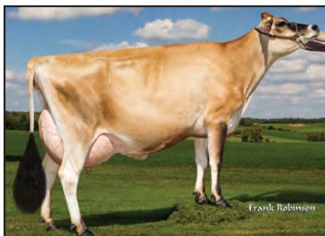
Sold in the 2014 Pot O'Gold Sale JX Buttercrest Clark Goblet {4}, E-91% 5-04 305 3x 26,110 4.5% 1184 3.9% 1026