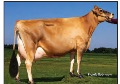
PINE-TREE FORMIDABLE FRECKLES-ET Sister to the Dam of Lot 102