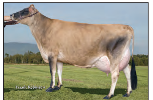
Sold in the 2005 Pot O'Gold Sale Schirm Rocket Vintage-ET, E-90% 4-2 365 40,210 4.8% 1,927 3.6% 1,451