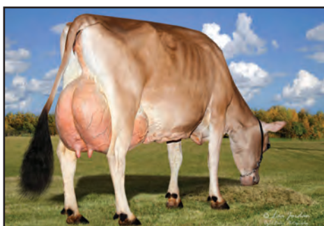
Sold in the 2012 Pot O'Gold Sale Waunakee Plus Jolt 3277 {6}-ET, E-92% 4-5 305 31,380 4.3% 1,362 3.8% 1,200