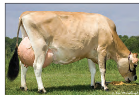
Sold in the 2005 Pot O'Gold Sale Ahlem Jace Charm 15069-ET, VG-88% 2-1 305 3x 33,550 4.6% 1,546 3.1% 1,048 Winner, 2008 Pot O'Gold Production Contest