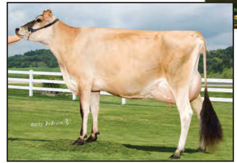
Sold in the 2009 Pot O'Gold Sale Jars of Clay latola 16710 2751, VG-87% 2-3 305 3x 20,230 4.6% 924 3.6% 727